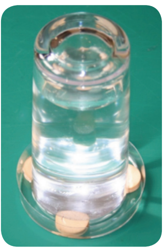
Step 1 Fill a tumbler full of water and place a shallow dish over the top.