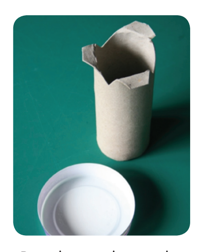
Bend over the ends of the kitchen roll. Cut the bottom off a cream or yoghurt pot. Glue the kitchen roll to the pot with a glue gun.