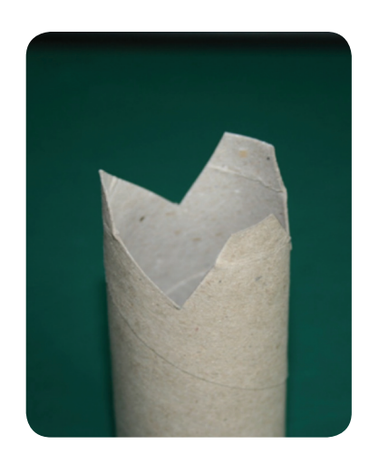
Cut the end of a kitchen roll tube with three deep V-shaped cuts.