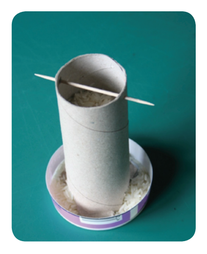
Fill the tube with rice. If you want, you can pierce the tube at the top and hang it up with a cocktail stick and a piece of string.

Please note that hens should not be fed uncooked rice as it swells up in their stomachs. We have used rice here to model the pellets often used to feed hens.